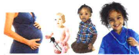
Pregnant Woman Infants Toddlers Up to Age 5

Head Start and Early Head Start provide FREE learning and development services to pregnant women and children ages birth to five.